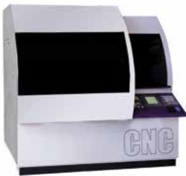
CNC machine tool